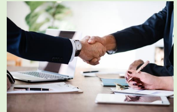
Or reach agreement