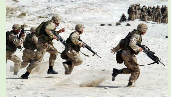
Going to cause shock and awe