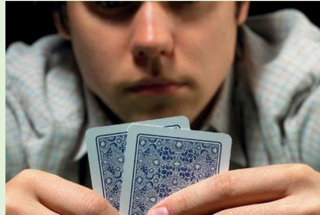
When no one knows whether you are